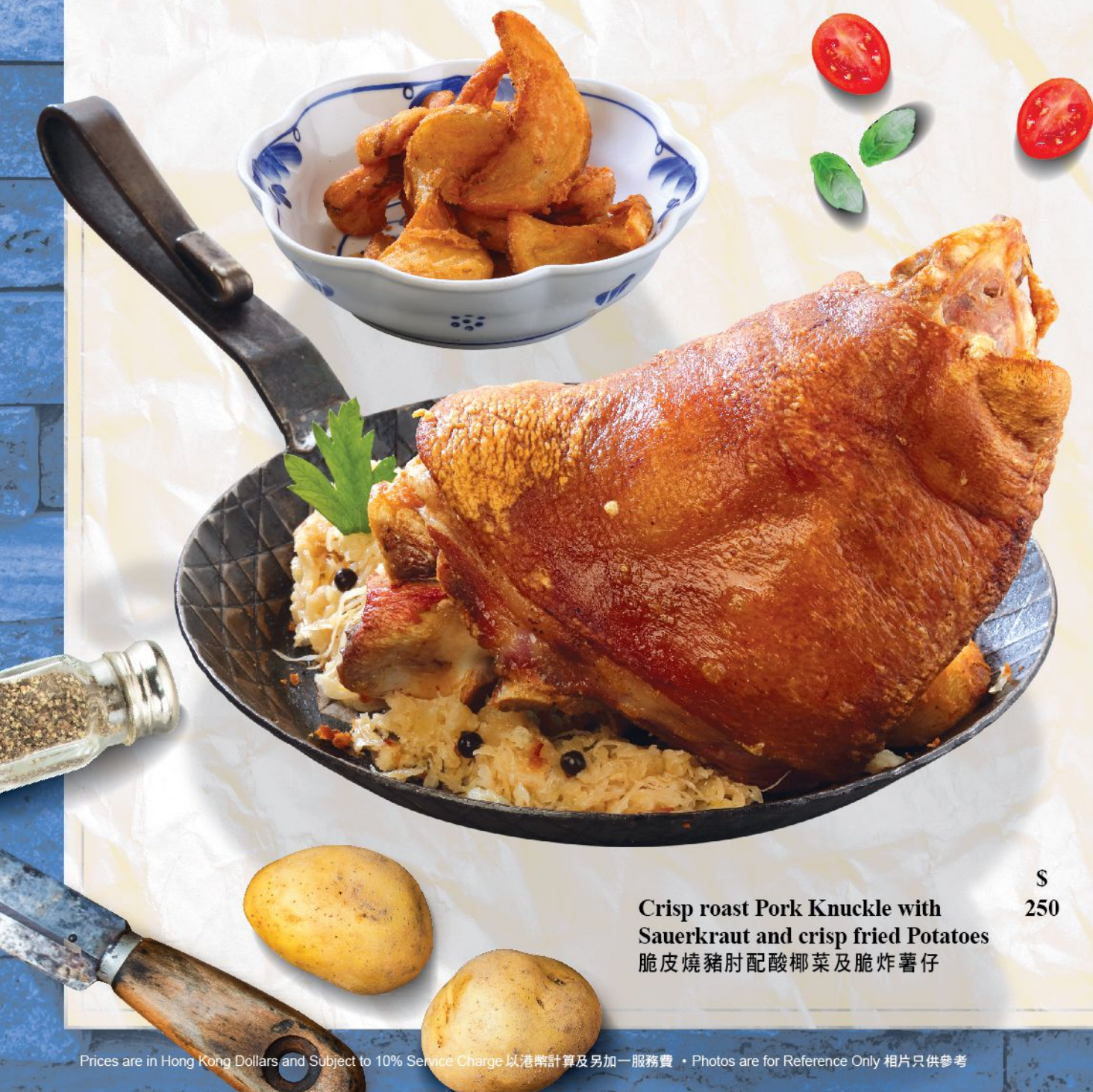
Crisp roast Pork Knuckle with Sauerkraut and crisp fried Potatoes 脆皮燒豬肘配酸椰菜及脆炸薯仔