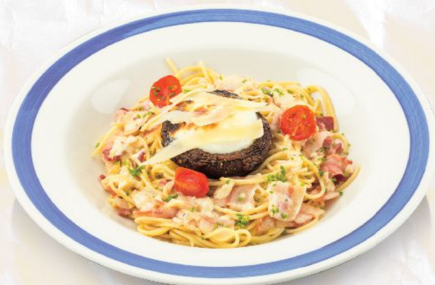
Spaghetti "Carbonara" with Portobello Mushroom, "Onsen" Egg and Pancetta