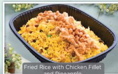
Fried Rice with Chicken Fillet and Pineapple 菠蘿雞柳炒飯