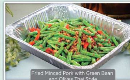
Fried Minced Pork with Green Bean and Olives Thai Style 泰式攪角炒肉碎四季豆