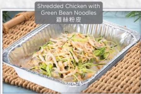
Shredded Chicken with Green Bean Noodles 雞絲粉皮