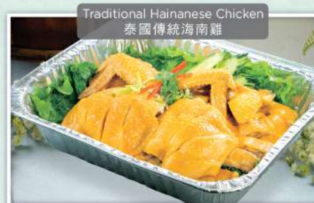
Traditional Hainanese Chicken 泰國傳統海南雞