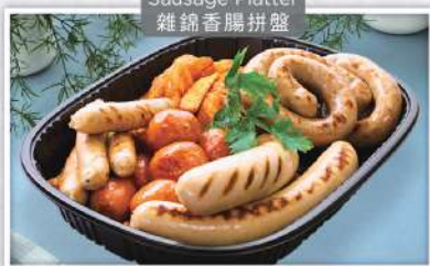
Sausage Platter 雞錦香腸拼盤