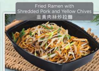
Fried Ramen with Shredded Pork and Yellow Chives 韭黃肉絲炒拉麵